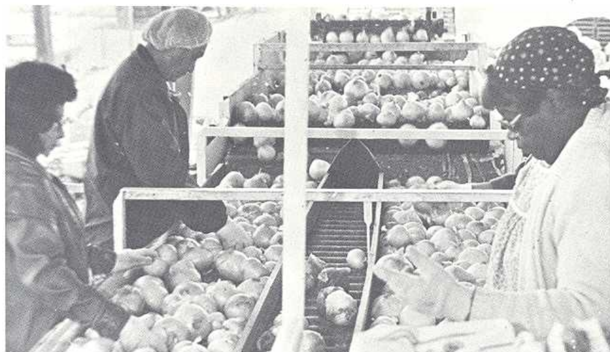
Onion sorting and grading