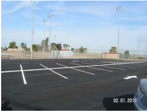
Sun Flower Baseball Parking Lot